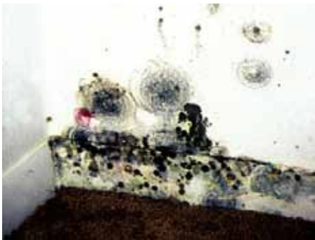
Mold growing on a wall.

You cannot see mold spores because they are too small, but once the mold starts to grow, you will notice it.