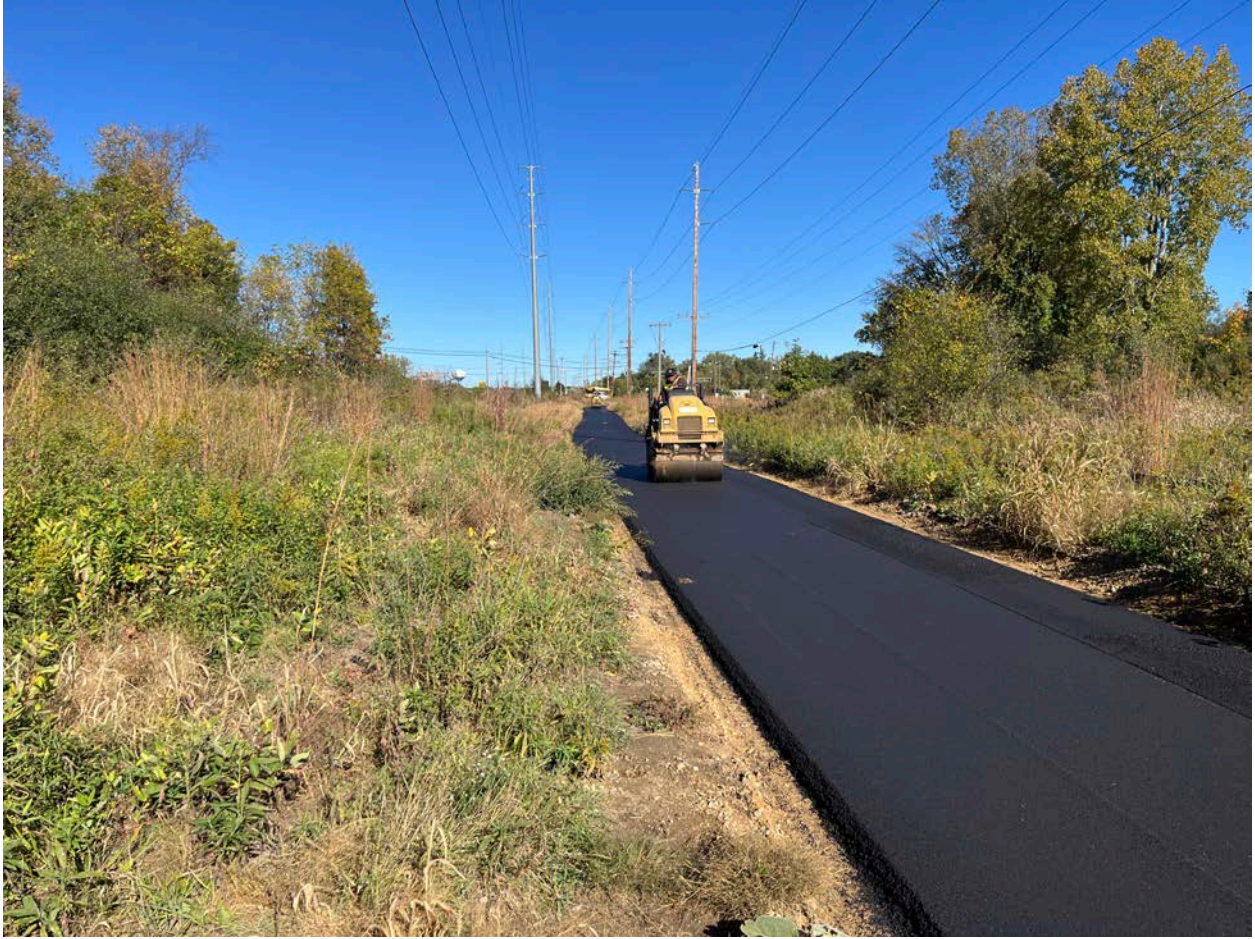
Lakeland Asphalt top course paving on the Mike Levine Lakelands Trail.