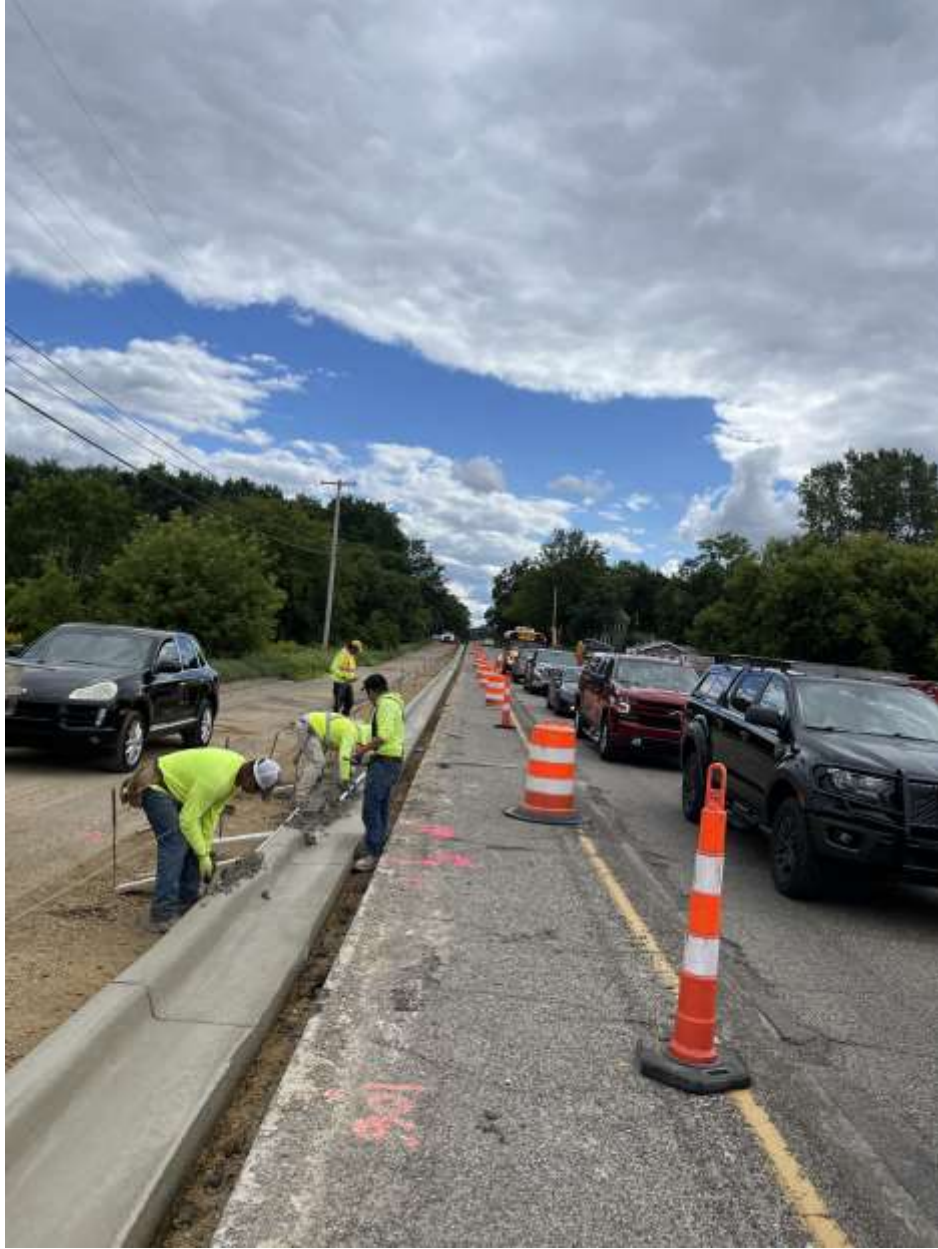
Concrete Curb and Gutter placement on Lansing Avenue and Parnall Road.